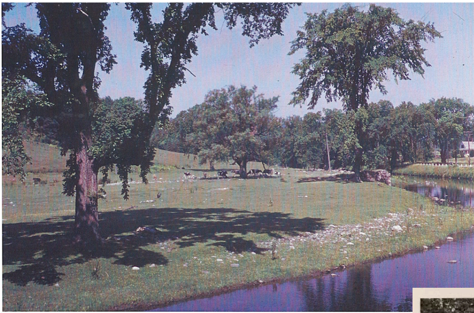
CIRCA 1960, LOOKING WEST