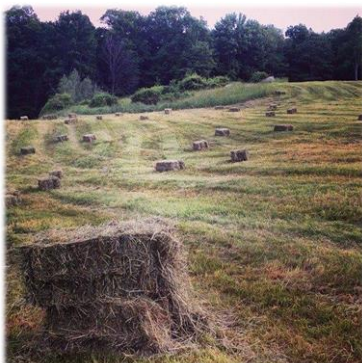
Hemenway Hill Farm