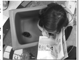
First graders enjoy reading to their newly hatched chicks!