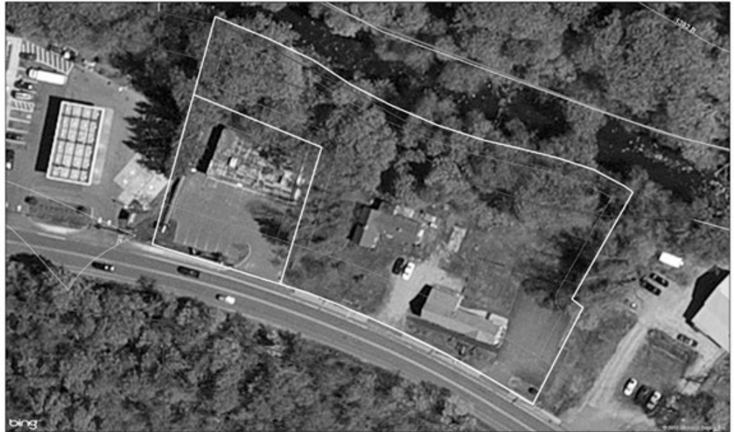
37 & 45 MAIN ST WILLIAMSBURG, MA

Top Parcel Boundaries Sublot 100 Year Flood Zone 500 Year Flood Zone Wetlands Wetlands (100% & Open Water (200% Buffer) Wetlands (200% & Open Water (200% Buffer) Wetlands (200% & Open Water (200% Buffer) Wetlands (200% & Open Water (200% Buffer)