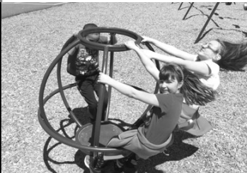
Students enjoy recess fun on a sunny spring day.

Throughout the winter, the Anne T. Dunphy School building was a busy place. Aside from the busy school days, the Williamsburg Recreation Department utilized the building to provide an active basketball program for both girls and boys from 1 st through 6 th grade. More than 36 basketball games were held in the Earl Tonet Gymnasium in addition to many weekly practices and other adult community sports groups.